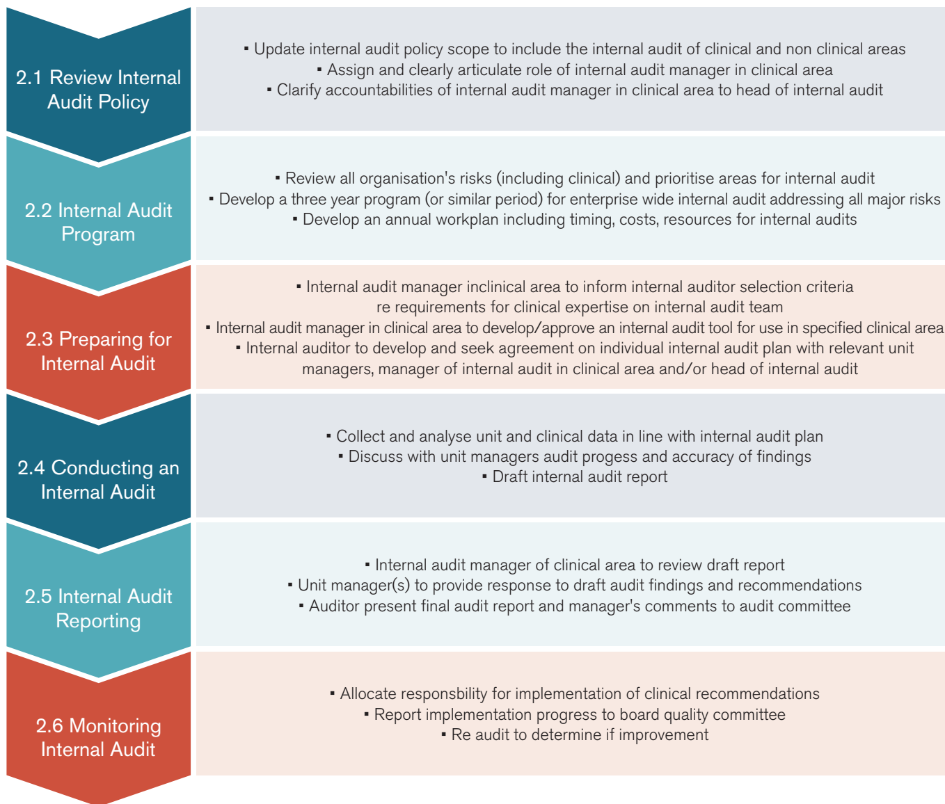
Diagram Three: Summary of key processes in the internal audit of clinical areas

The key steps in developing a risk based internal audit program in an organisation that reflects the key clinical risks in healthcare are summarized in Diagram three below.